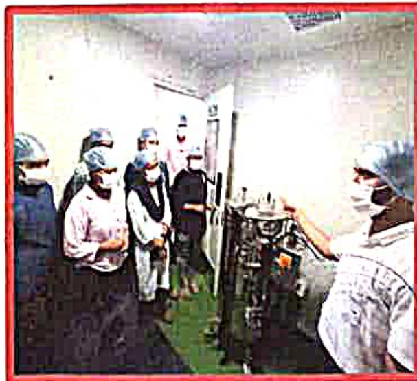
Visit to NeuvocarePharmaceuticals Pvt.Ltd., Nasik (MS)

Loknete Vyankatrao Hiray Marg, Malegaon camp, Nashik, Maharashtra - 423105, Tel: (02554) 25256 email : piin.sphpharmacycollege@mgvnashik.org Website : www.mgvnmgpharmacy.kbhgroup.in